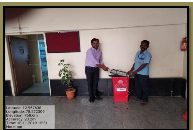
Staff and Lab Attender dumping the E Waste