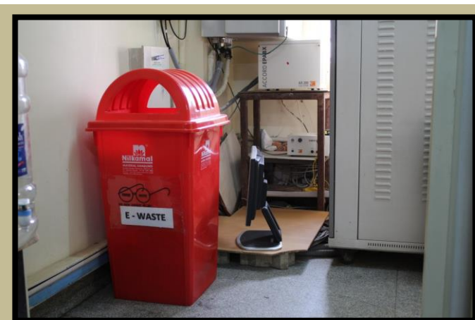
Red Colour Bin to dump E Waste in Computer Lab

Awareness was created to the students on safe disposal of Ewaste on the World Environment Day and 80 Kg of Ewaste generated in the college and collected from the students are disposed to a certified vender E-Cycle Solutions , Bangalore.